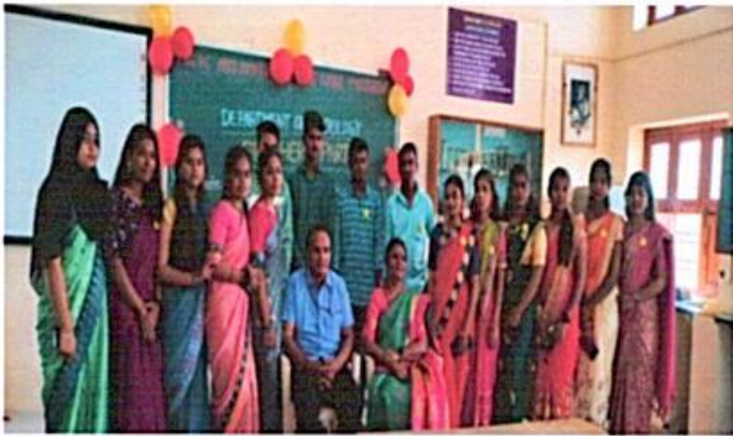
Staff with new comers (2022-23)

[Signature] Head of the Department of Zephyrus