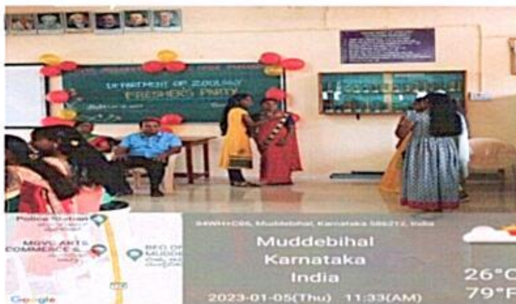
Welcome to the freshers by presenting smiley emoji

Students of first year BSc (batch 2022-23) were welcome by presenting the badge of smiley emoji to this party which was organized by the students of Bsc II & III rd year in the department of zoology