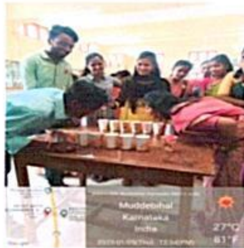
Different Events for the Freshers